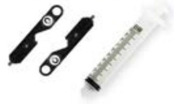
EXO Tool Kit